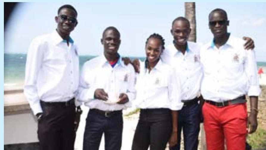
A section of the 2019 Students Organization Leaders (UNSA)

Students are encouraged to participate in extra-curricular activities while at the University. One such outlet is participation in professional associations and clubs. These associations not only address the professional and personal welfare interests of students, but they also provide opportunities for performing community service and personal development. The University has various students bodies, which represent students' interests. Through the various representatives, students access all decision-making levels from the halls, the Senate, and all the way to Council. The University of Nairobi is committed to seeing that student organizations are fiscally able to meet their desired goals and aims. Student Organizations should liaise with Deans of Faculties and Directors of Institutes for further guidance.