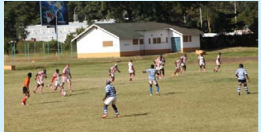
The Mean-Machine University of Nairobi Rugby Team

Basketball men and women always qualify among the top 4 teams in the country that participate in the playoffs for the last 7 years. Mean Machine was the flood light champion in 2006 and runners up in Enterprise Cap in 2007, a league that attracts top clubs in East Africa. Mean Machine has also won 2 Gold Medals and 2 Bronze Medals in the last 3 East African Interuniversity Games editions.