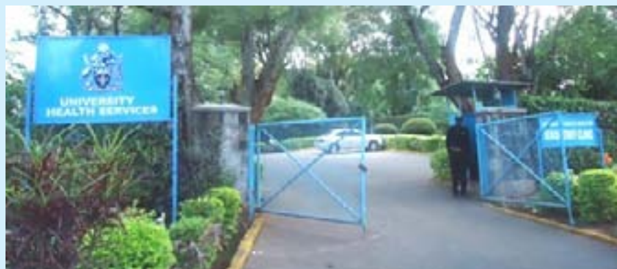
The entrance to the University of Nairobi Health Services Clinic along State House Road

The maternity care provided will exclude delivery, pregnancy related complications and services received from private facilities.