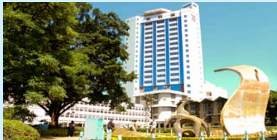
The University of Nairobi Towers at the Main Campus

Association of Business Studies Students (ABSS) E-Mail: absskikuyu@yahoo.com