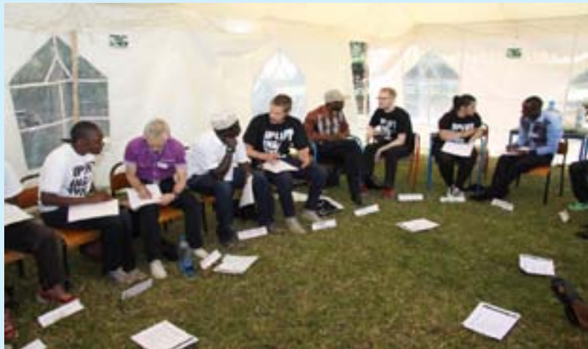
School of Education has won USD 300,000 from USAID to Launch Early Grade Instruction Curriculum